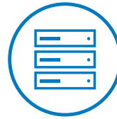
Secure Hosting & Outsourcing

CDS Healthcare Payer Suite® is an enterprise core administrative and claims management system that helps clients achieve operational efficiencies, lower costs and provide an enhanced experience for members and providers.