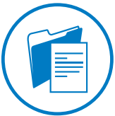
DocFinity® ECM & BPM/Workflow

Our application management services give you the freedom to focus on your core competencies instead of unforeseen costs, security breaches and IT tasks.