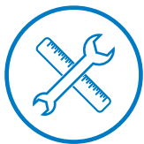
Application Development & Maintenance

Cloud Companion delivers a robust, scalable cloud-based solution that focuses on your application, integrates your systems and manages your technology.