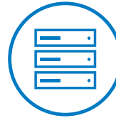
Secure Hosting & Outsourcing

CDS Healthcare Payer Suite® is an enterprise core administrative and claims management system that helps clients achieve operational efficiencies, lower costs and provide an enhanced experience for members and providers.