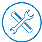
Application Development & Maintenance

Cloud Companion delivers a robust, scalable cloud-based solution that focuses on your application, integrates your systems and manages your technology.