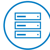
Secure Hosting & Outsourcing

CDS Healthcare Payer Suite SM is an enterprise core administrative and claims management system that helps clients achieve operational efficiencies, lower costs and provide an enhanced experience for members and providers.