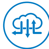
Cloud Companion ®

DocFinity ® is our award-winning enterprise content management and business process management solution that provides the ability to design and automate workflows through a single interface.