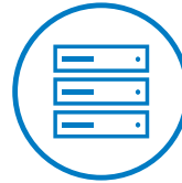
Secure Hosting & Outsourcing

CDS Healthcare Payer Suite SM is an enterprise core administrative and claims management system that helps clients achieve operational efficiencies, lower costs and provide an enhanced experience for members and providers.