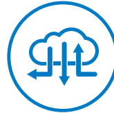
Cloud Companion ®

DocFinity ® is our award-winning enterprise content management and business process management solution that provides the ability to design and automate workflows through a single interface.